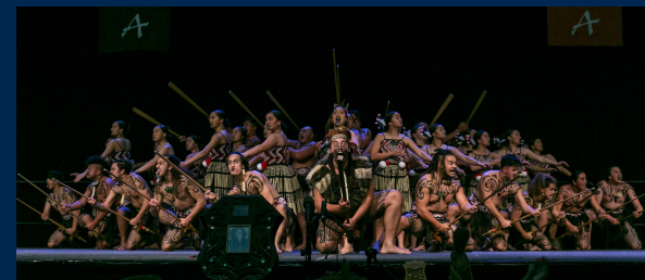
Photo: 2019 Regional Champions Raukura Kapa Haka

Pānui will be posted to the Daily Notices & written on the Whare whiteboard in W2, regarding auditions/practices & kaupapa to do with the kapa.