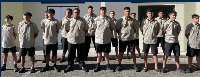
Photo: 2021 11THG students

Should students be successful in gaining a place in 11T next year, students and parents will be reminded of the signed 11T Graduate Profile, and lists the expectations that students are to adhere to as a student of Te Whare o Raukura.