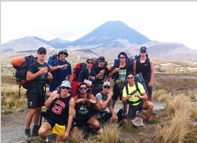
Hostel students enjoy living amongst the beautiful scenery in Rotorua and New Zealand.