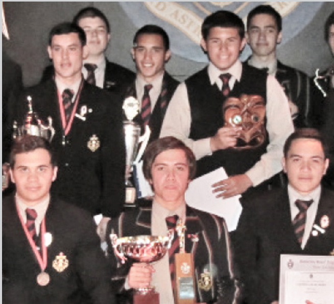
Achievements are celebrated.