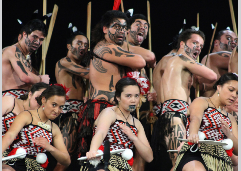
Students from Rotorua Boys' and Girls' High Schools combine to form the Raukura Kapa Haka team.