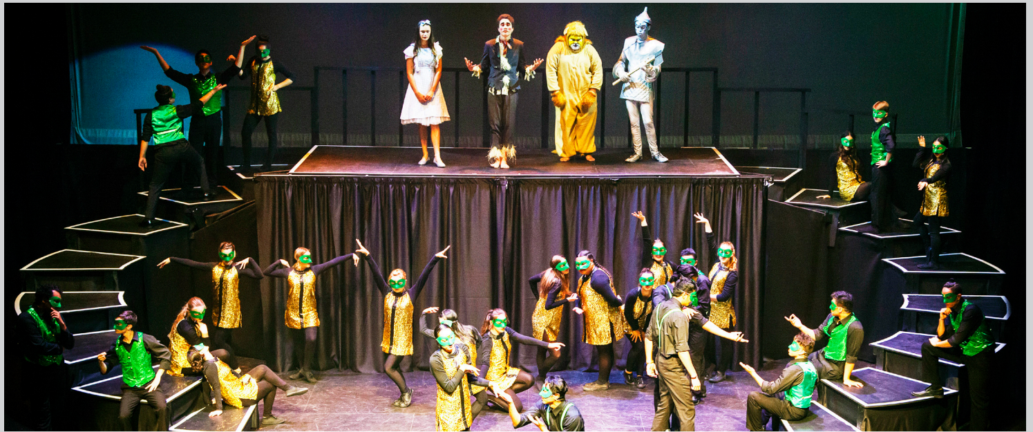
Rotorua Boys' High School joins with Rotorua Girls' High School for musical productions.