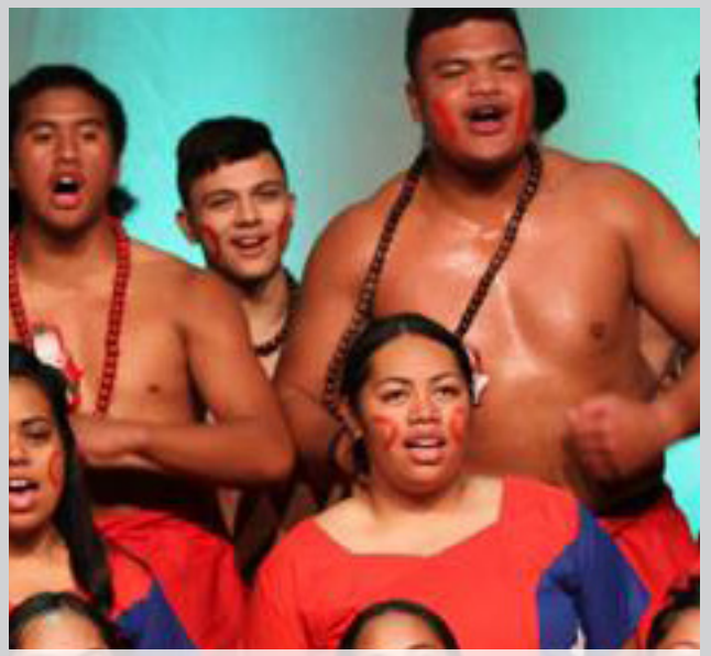
Rotorua Boys' and Rotorua Girls' High Schools' Pasifika Group.